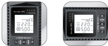
Two directions LCD display